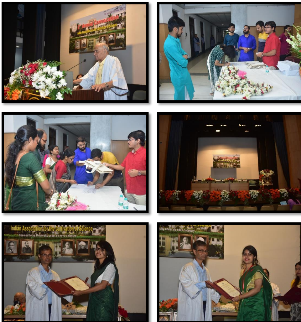
2 nd Annual Convocation Program celebrated at IACS on 29 th July, 2022