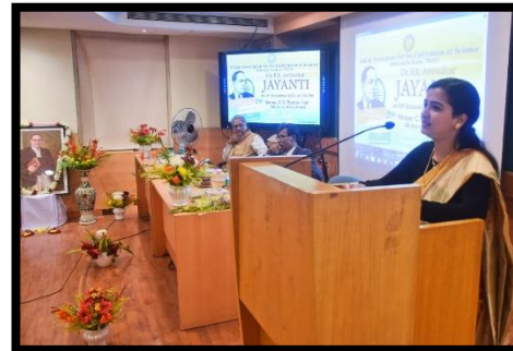
Celebration of Ambedkar Jayanti on December 14, 2022 at IACS.