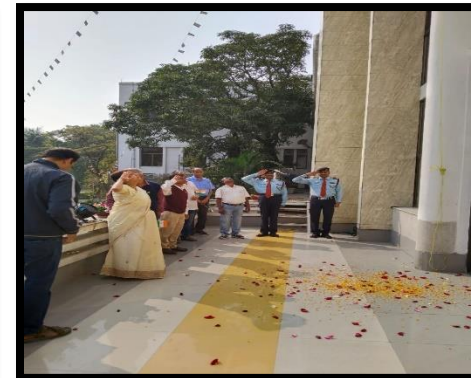
74th Republic Day Celebration at IACS Premises on 26th January, 2023