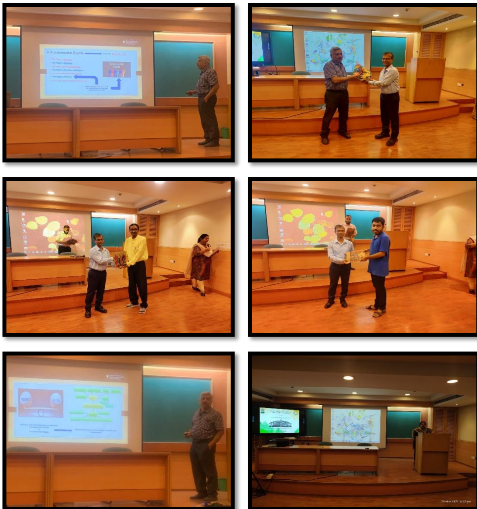
Constitution Day Celebration at IACS on 26 th and 28 th November, 2022.