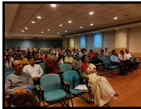
"International Mother Language Day" celebration at IACS on 21st February, 2023