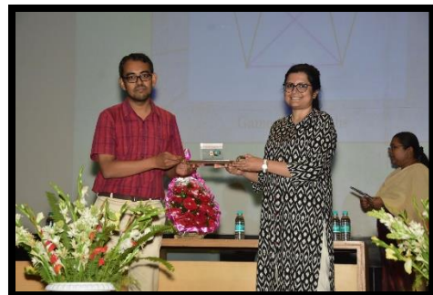
National Science Day Programme celebration at IACS on 28th February, 2023.